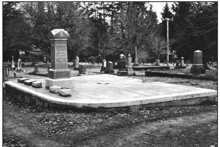
Plot No. 949, the plot of William England, is shown with new concrete cap having sectional expansion joints and a very slight crown to facilitate run-off.

The project called for breaking up and removing the failing 4-inch-thick concrete cap, removal of monuments and stem wall coping stones, bringing a deflected north wall into proper alignment, filling and leveling the above-grade mound of earth, pouring an improved reinforced concrete cap, and returning monuments to their original positions. (continued on page 2)