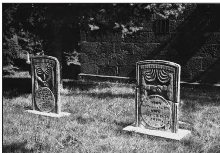
After a long period of dislocation, the matching pair of broken headstones of Territorial stage station operator Darius B. Cartwright, right, and his two sons were reset in appropriate places in Plot No. 107.

Burial records helped to verify the original placement of the Cartwright headstones in Plot 107, where only one of the original bases remained, that of D. B. Cartwright, the father. Some time ago, the headstones were stacked on a nearby plot, where they rested provisionally until 2010, when the stones were sawed for straight base ends and reset in new bases of concrete. Although the remaining original basalt base was irreparably fractured and rendered unusable, it was left as a physical record and the new base was placed in front of it to receive the repaired headstone of the senior Cartwright. The concrete bases were made by Jeff Hilts Marker Setting. The headstones were reset by FOPC field volunteers.