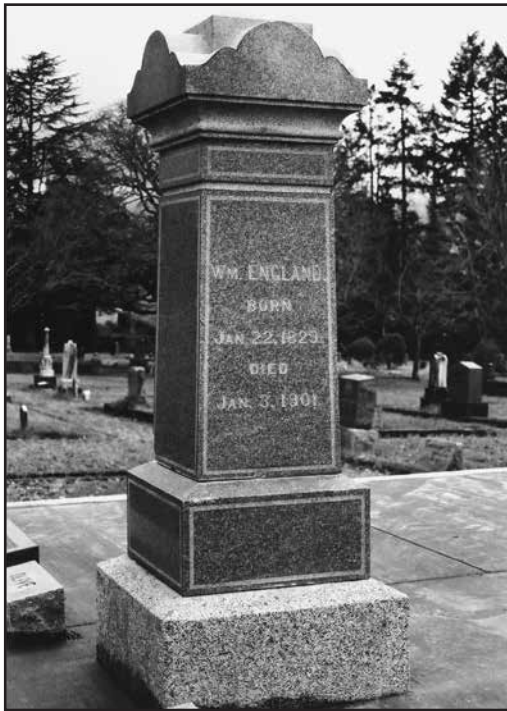
The stacked polished granite shaft monument bearing epitaphs of William England, Olive Stanton England Enright, and their son, Eugene A. England, now upright after restoration, had been leaning due to failure of concrete and a tilted footing.